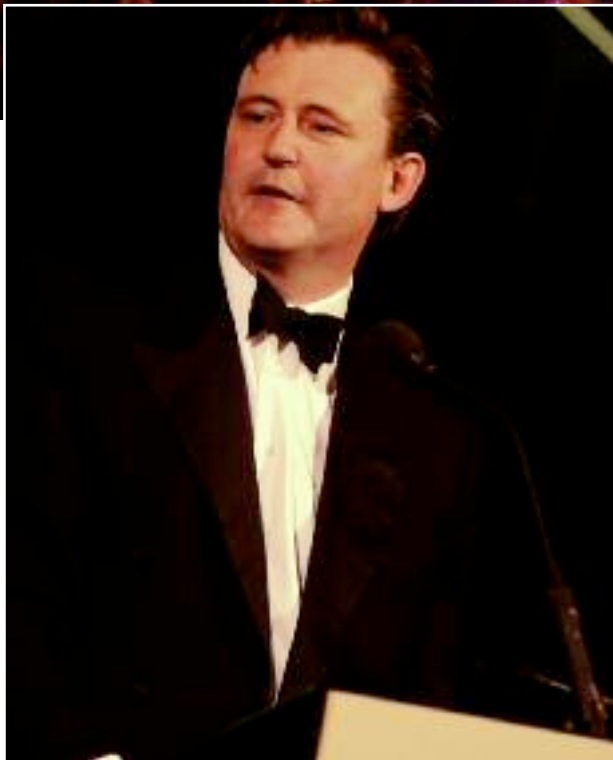
Visionary: John Micklethwait, The Economist