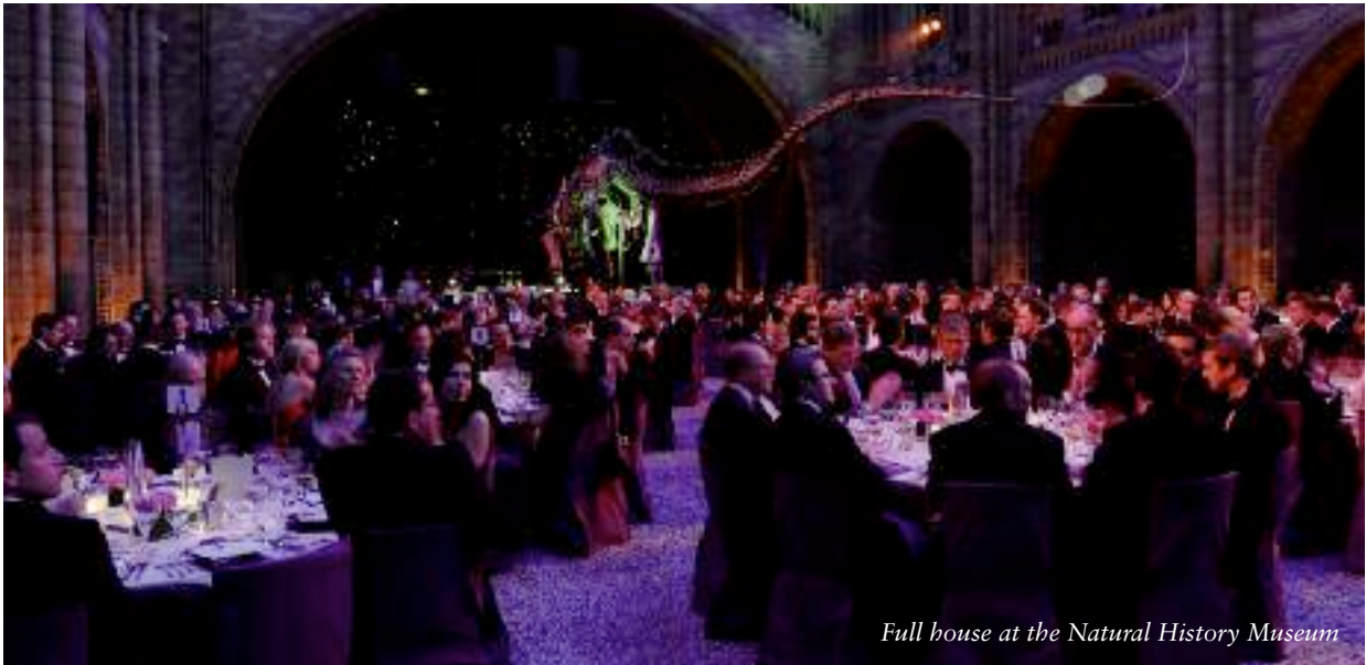
Full house at the Natural History Museum

In June, 300 industry professionals from around the world spent a memorable evening at London's Natural History Museum for PEI's first ever Global Winners Celebration, a summer party for the Private Equity International Awards.